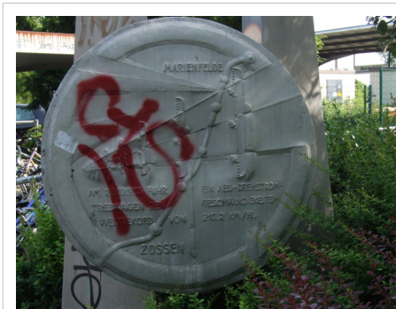
Denkmal zur Erinnerung an den Geschwindigkeitsweltrekord

Der Haltepunkt Marienfelde wurde mit der Dresdener Eisenbahn am 17. Juni 1875 eröffnet. Wenige Monate später, am 15. Oktober 1875 war die Station dann auch ein Halt an der Militärbahn vom Berliner Militärbahnhof nach Zossen. Der Haltepunkt lag damals weit ab von der Bebauung. Er war ein Anstoß zur Erschließung von Neu-Marienfelde.