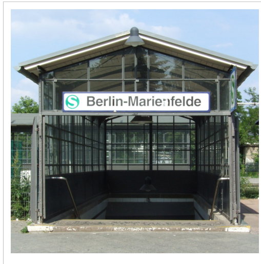
Zugang zum S-Bahnhof Marienfelde